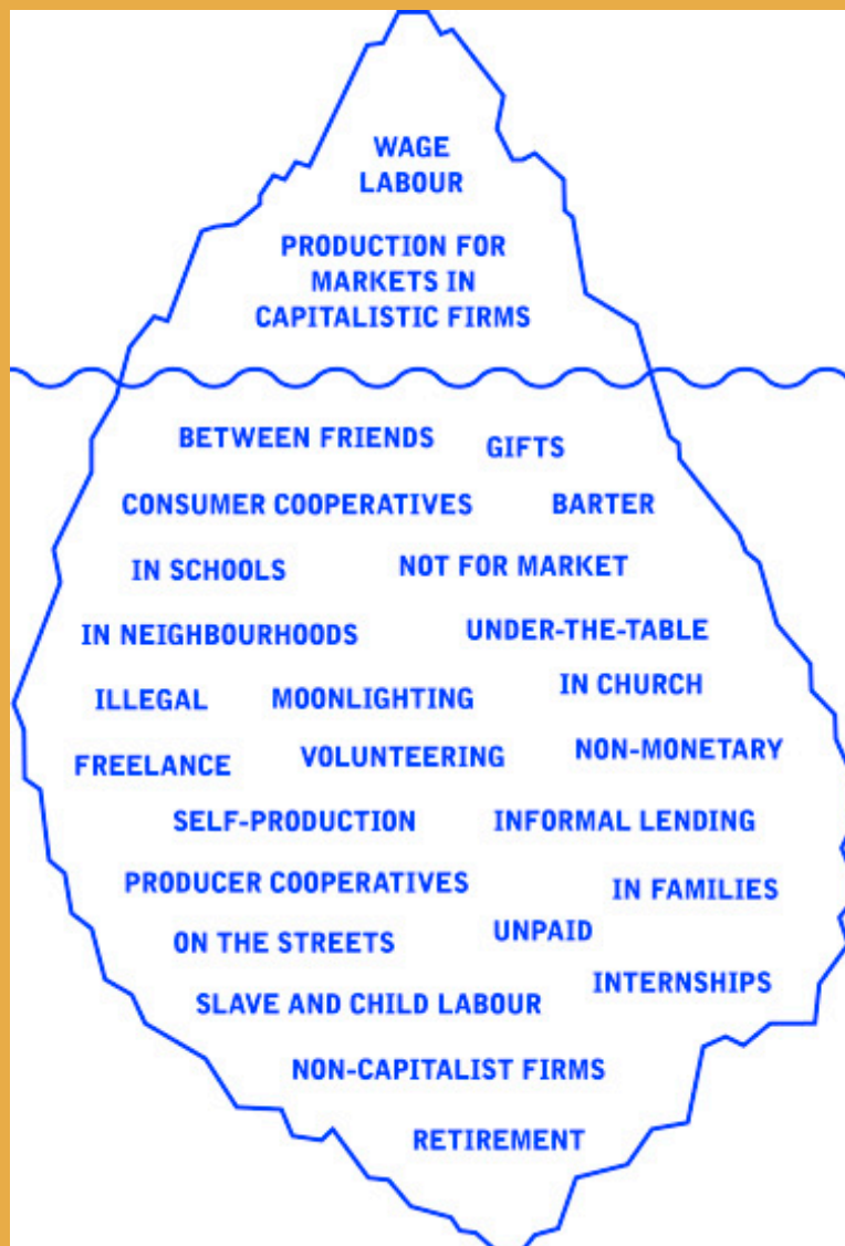
Diverse Economies Iceberg by J.K. Gibson-Graham